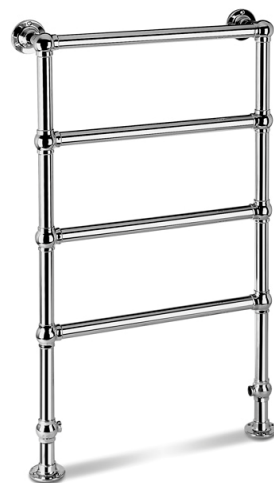
Buckingham 3 & 4