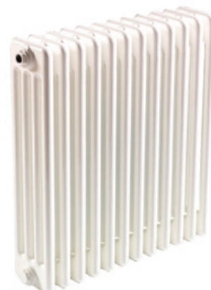
Tubular (TB600 4 column)